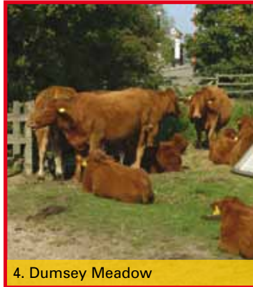
4. Dumsey Meadow