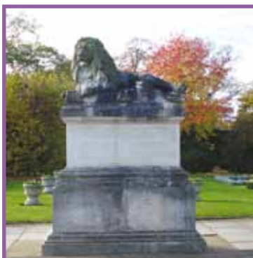
9. Lendy Lion