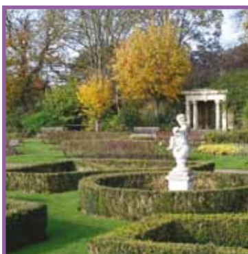
9. The Walled Garden

If you are interested in finding out about history in Spelthorne visit www.spelthornemuseum.org.uk