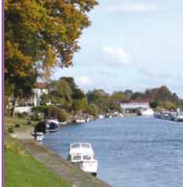
9. Sunbury-on-Thames Riverside